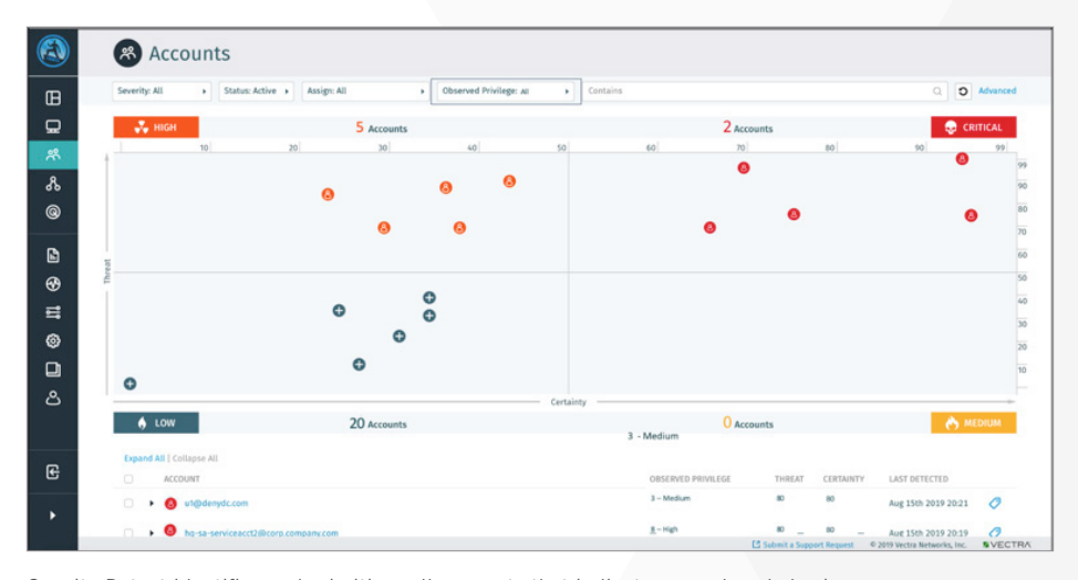
Cognito Detect identifies and prioritizes all accounts that indicate anomalous behaviors

This viewpoint is similar to how attackers observe or infer the interactions between entities. In order to succeed, it is imperative that defenders think in a similar fashion as their adversaries.