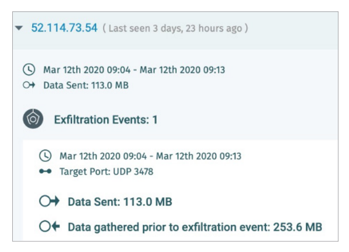
Figure 3. Data Smuggler behavior for Teams

In addition to configuration custom rules, Cognito has predefined triage templates for known web conferencing software designed to reduce the noise generated by web conferencing software.