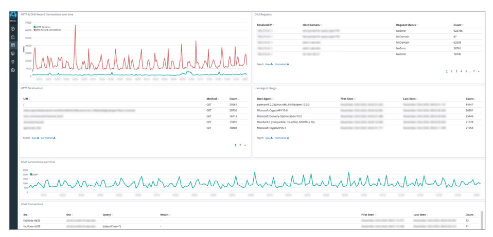
Vectra Recall enables threat hunters to identify anomalous behaviors