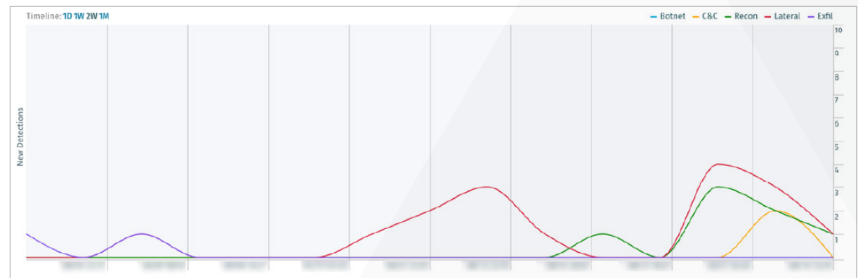
Detection chart on YY

The first spike in the chart occurred six days before the attack. The second spike shows the actual encryption.